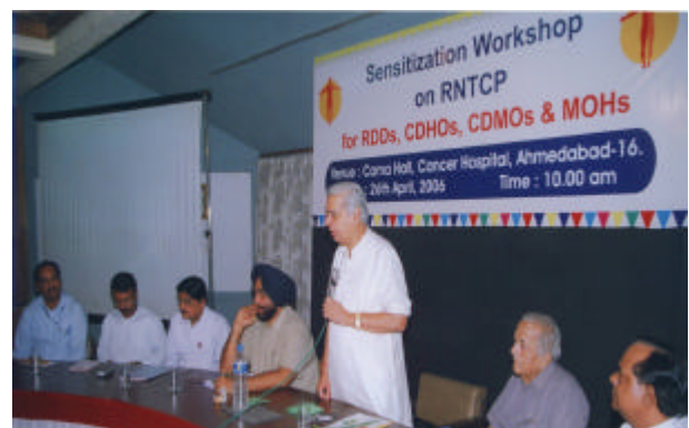
‘A state level sensitization training cum workshop on RNTCP ‘for senior official of Gujarat health service like Regional deputy Director, Chief District Health Officers, & Chief District Medical officer's was organized on 26 th April 2006 at Cama hall, Cancer Hospital ,Ahmedabad to ensure optimal participation of the general health system in the program and strengthen the district level monitoring and supervision. Hon'ble Health Minister of Gujarat attended this event affirming the strong Political and Administrative Commitment to the Programme.