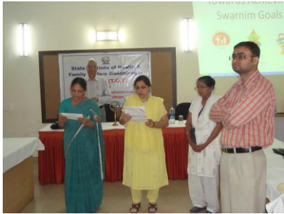
Inauguration of the training