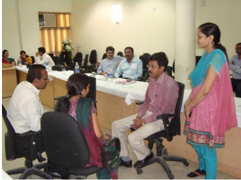
Role play on Anemia by the participants to the participants