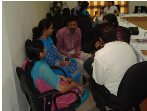
Group work given to the participants