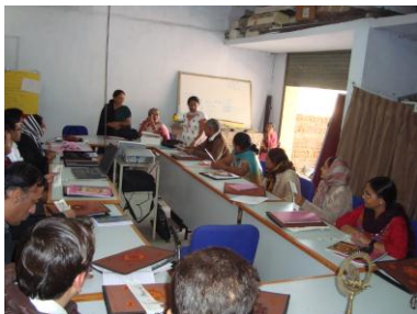
Expert taking session