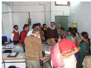
Demonstration of Inserting IUD