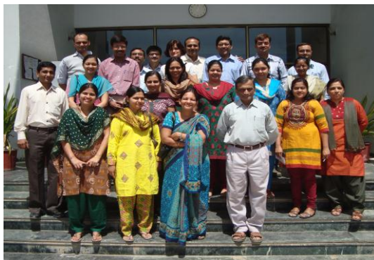
Group of the participants of Gujarat in BEmOC TOT- II